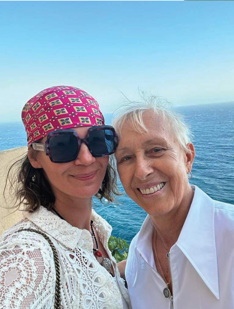
ON A VACATION IN CORSICA