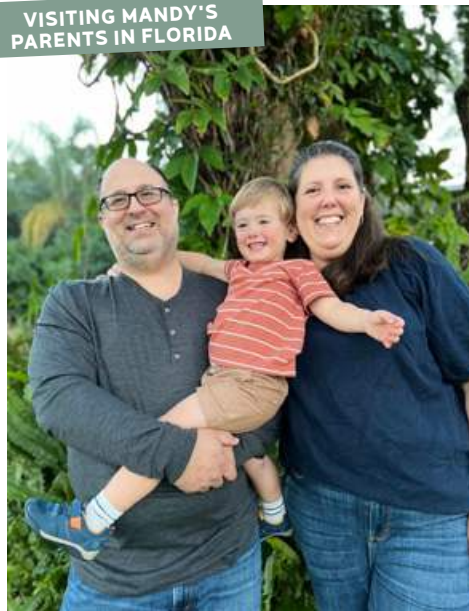
VISITING MANDY'S PARENTS IN FLORIDA