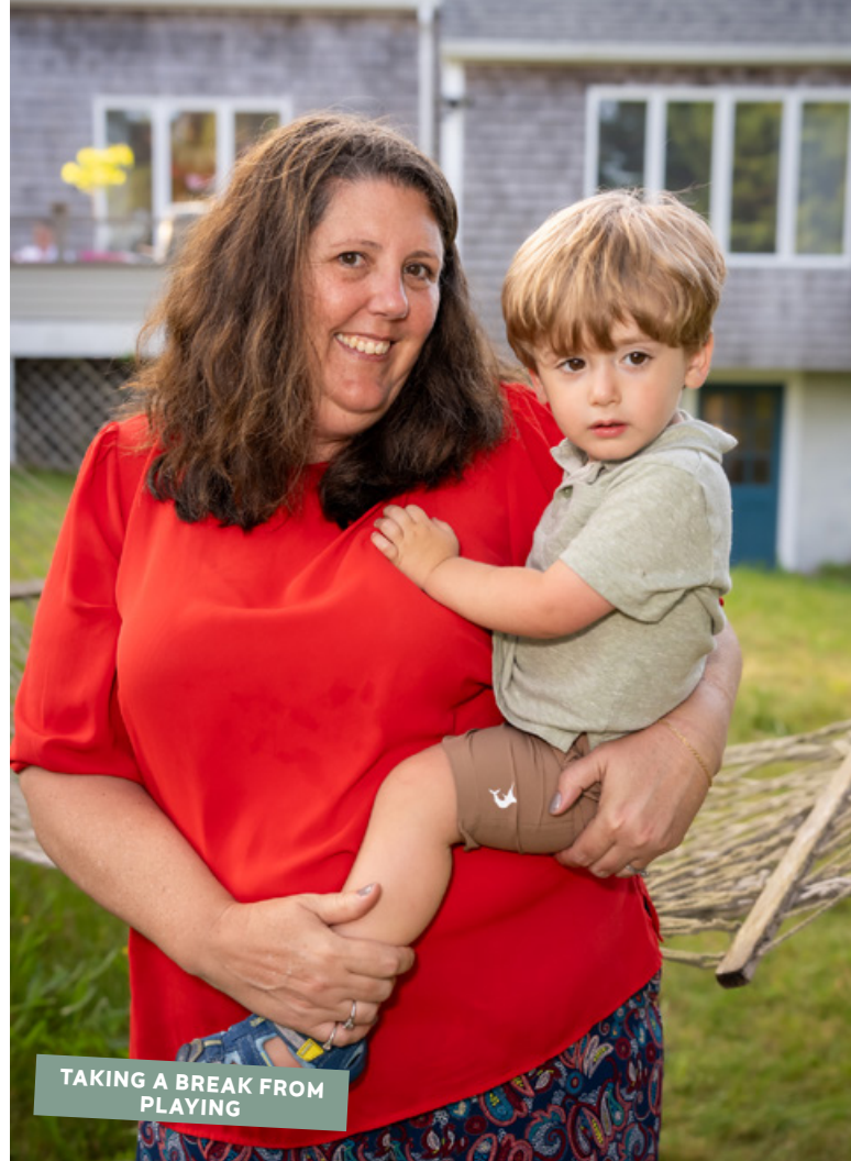
TAKING A BREAK FROM PLAYING

Nothing, however, compares to the joy I see in her since becoming a mother.