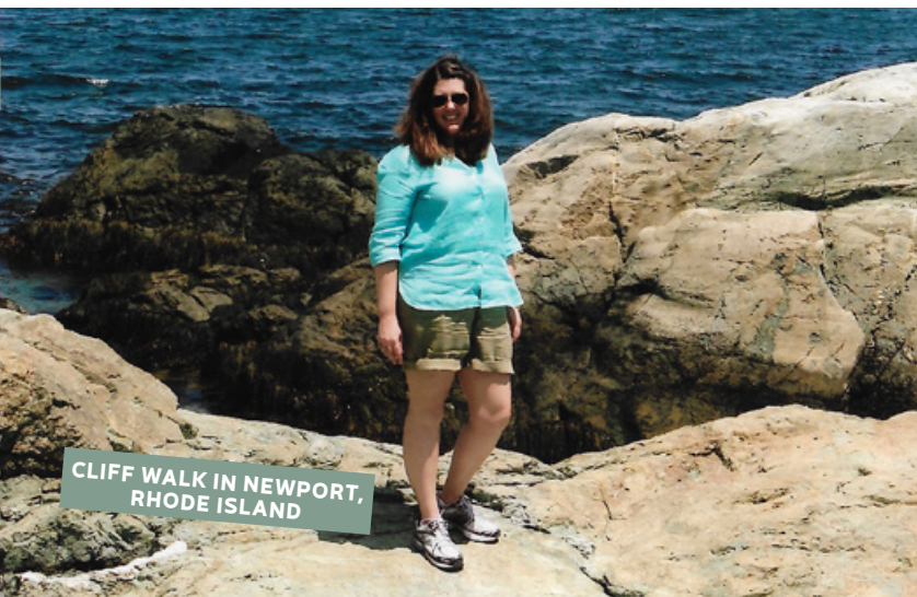
CLIFF WALK IN NEWPORT, RHODE ISLAND