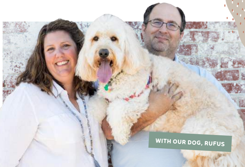
WITH OUR DOG, RUFUS

We love our little family, adore being parents, and have so much love to give. Thank you for getting to know us a little bit more!