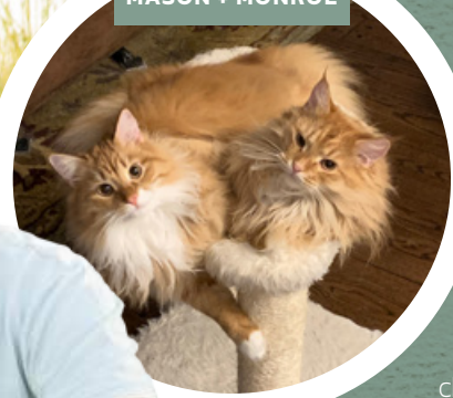
MASON + MONROE