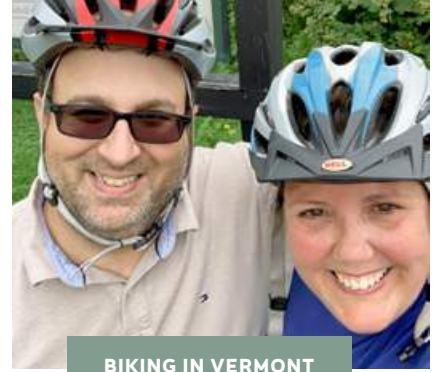
BIKING IN VERMONT

We met the "old fashioned" way...online!