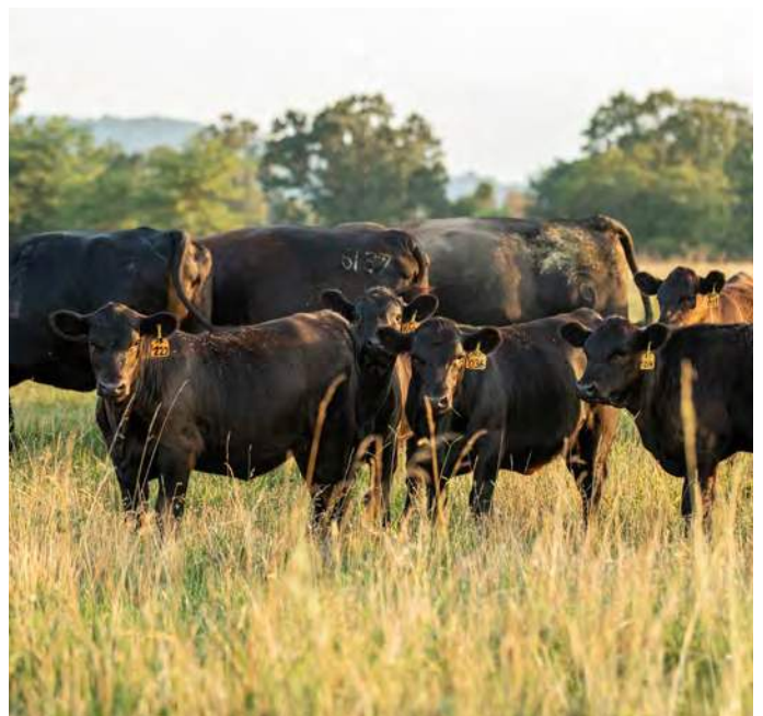
OUR VARIOUS FARM ANIMALS