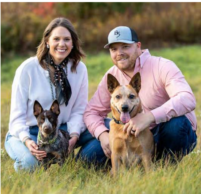
MINNIE + HONEY