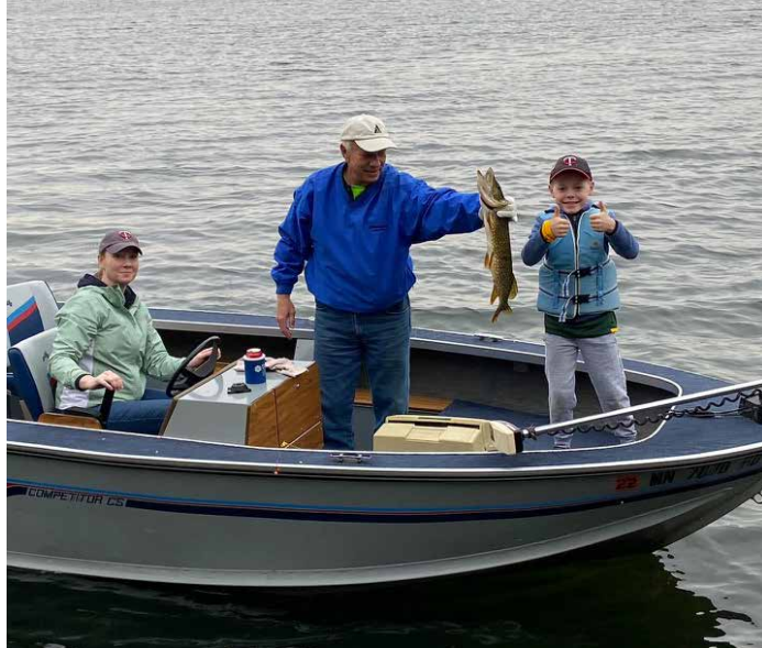
MY NEPHEW PROUDLY SHOWING OFF HIS CATCH