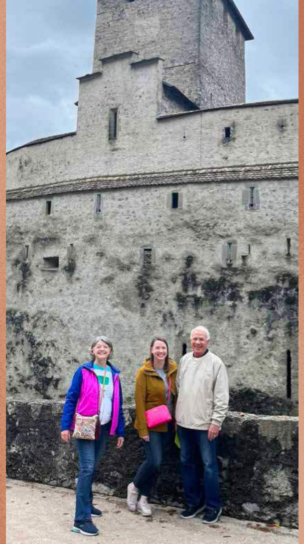
MY PARENTS AND ME AT A SWISS CASTLE