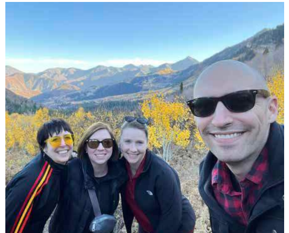
HIKING IN UTAH WITH MY FRIENDS

Outside of work, I'm a big Minnesota sports fan and love going to games. I adore traveling and am usually planning my next trip. My friends and I are always up for trying the newest restaurants. I also enjoy quiet nights at home spent playing the piano, crocheting, and reading the latest pick from my book club.