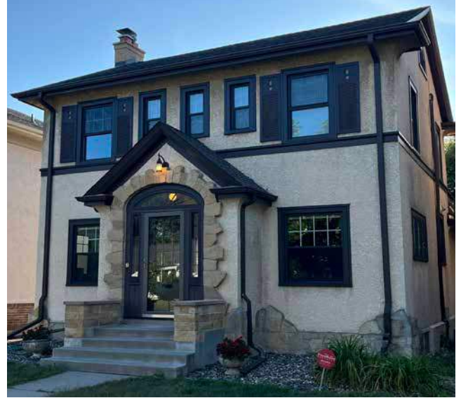
MY HOME IN THE SUMMER

I own a home in a charming neighborhood in Minneapolis, Minnesota.