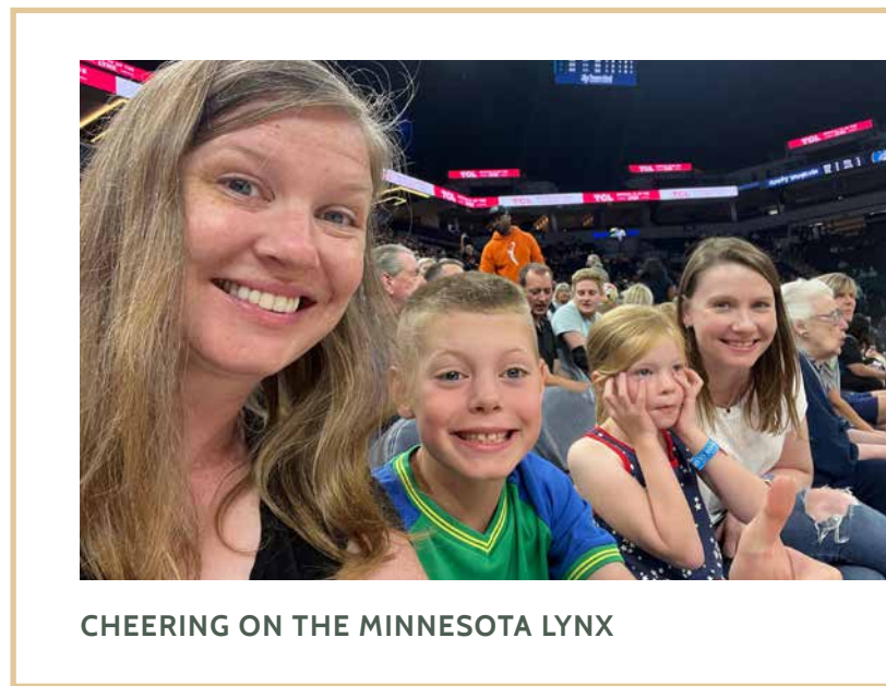
CHEERING ON THE MINNESOTA LYNX

I hope to meet you soon and learn more about you.