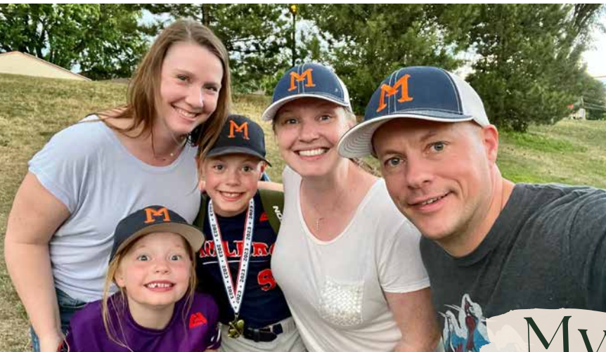
CHEERING ON OUR FAVORITE LITTLE LEAGUERS