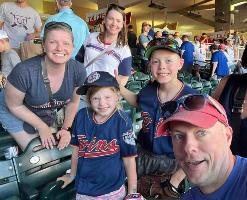
AT A MINNESOTA TWINS GAME WITH MY FAMILY