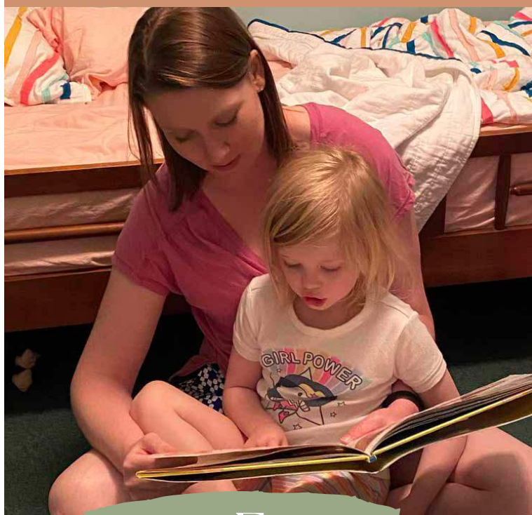
MY NIECE SHARES MY LOVE OF READING