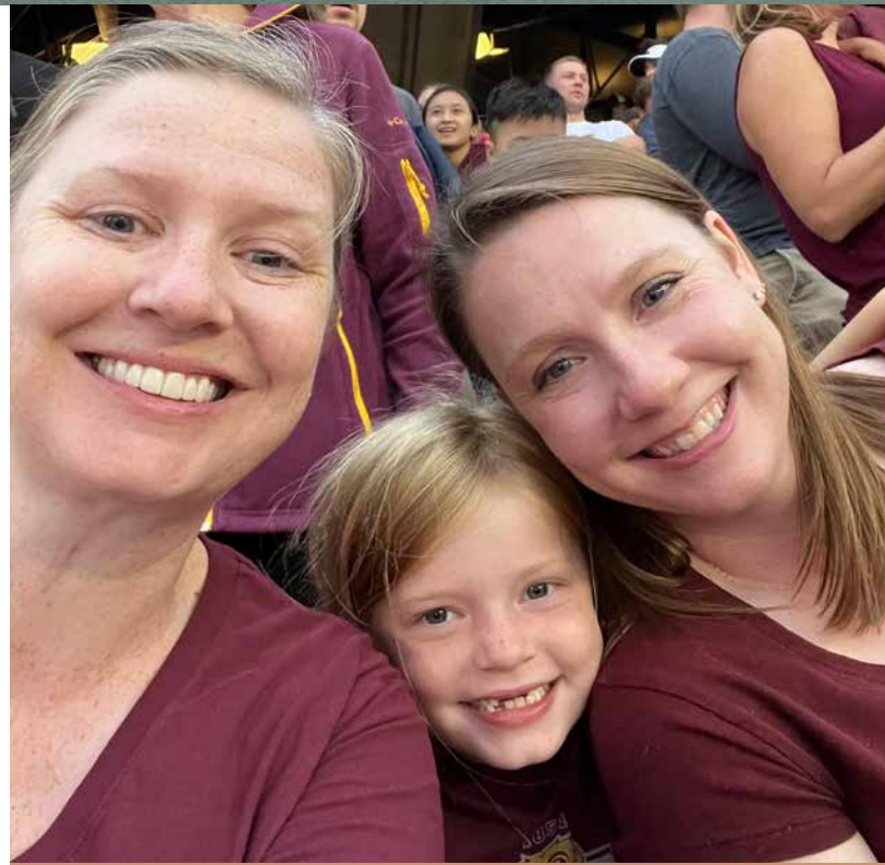
MY SISTER, NIECE AND I AT THE MINNESOTA GOPHERS GAME