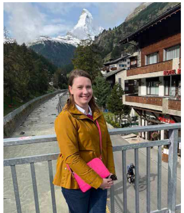
VIEW OF THE MATTERHORN FROM ZERMATT, SWITZERLAND