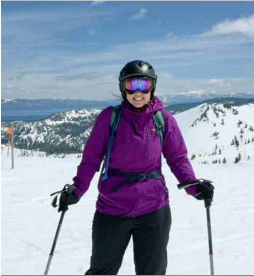
SKIING IN LAKE TAHOE, CALIFORNIA

I love running, biking, skiing, hiking, and gardening.