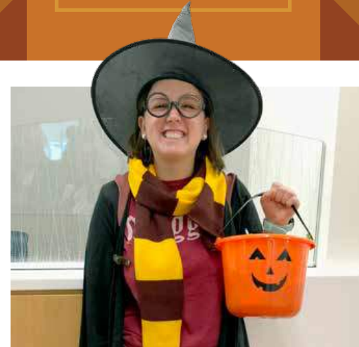
DRESSED UP FOR HALLOWEEN AT THE CHILDREN’S HOSPITAL