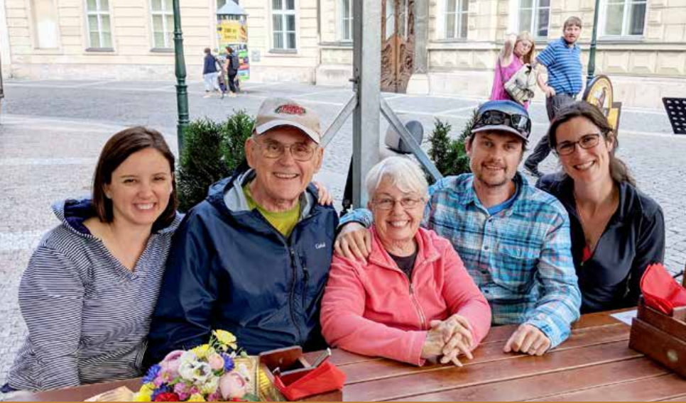
IN PRAGUE WITH MY FAMILY