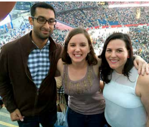
MY FRIENDS AND I AT A BEYONCÉ CONCERT

I absolutely love working with kids because of their bravery and resiliency that they show every single day.