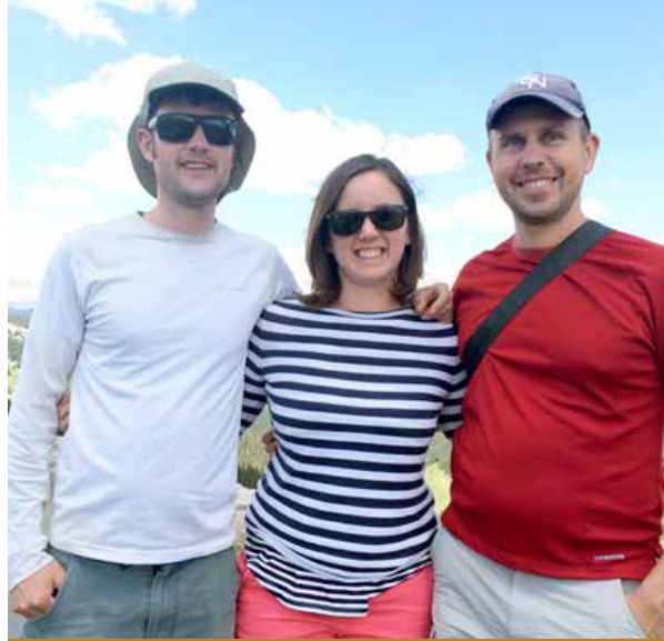
VACATIONING IN COLORADO WITH MY BROTHERS