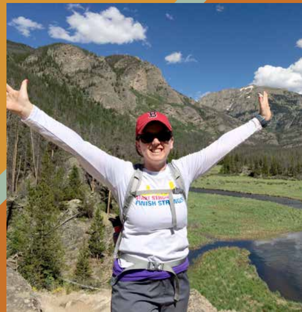
HIKING IN COLORADO

and I would love to walk that path with you as well as part of an open adoption.