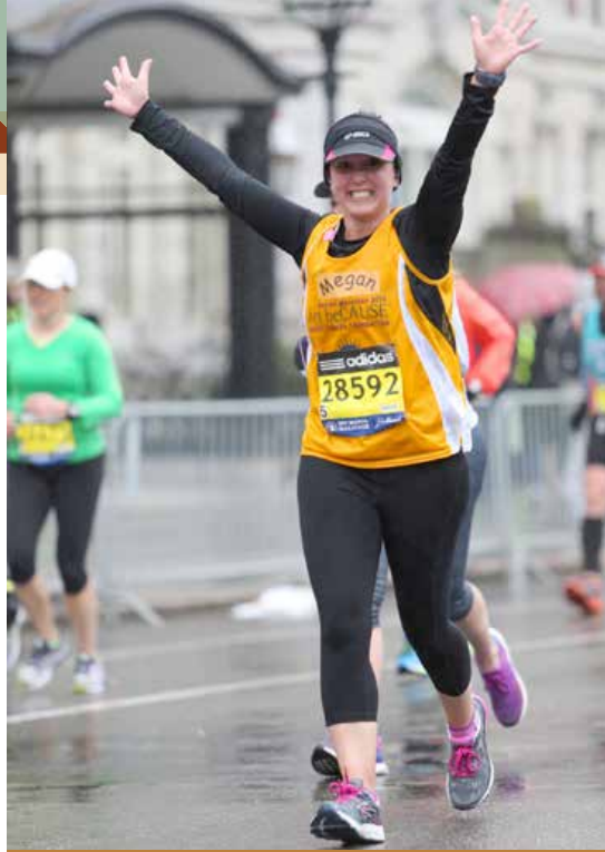
RUNNING THE BOSTON MARATHON

Really, I just love being outside! I have run 5 marathons in my life - most recently I ran the Chicago Marathon in 2019! During the summer months, I bike along Lake Michigan to commute to work - it is quicker than driving to work! But I also love to read and belong to a bookclub with my friends who live in my neighborhood. I belong to a community garden and love to grow vegetables in the summertime.