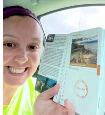
I LOVE COLLECTING NATIONAL PARK STAMPS

● I LOVE THE HARRY POTTER BOOKS. I even went with friends to a bookstore at midnight in New York City when the 7th book was released.