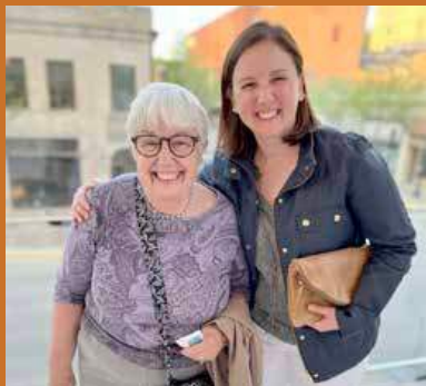
GOING TO SEE A MUSICAL WITH MY MOM