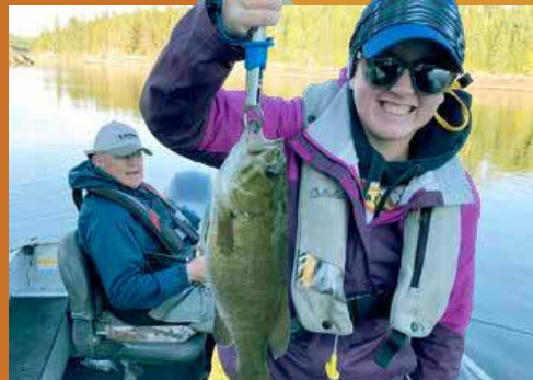
ANNUAL CANADIAN FISHING TRIP WITH MY DAD