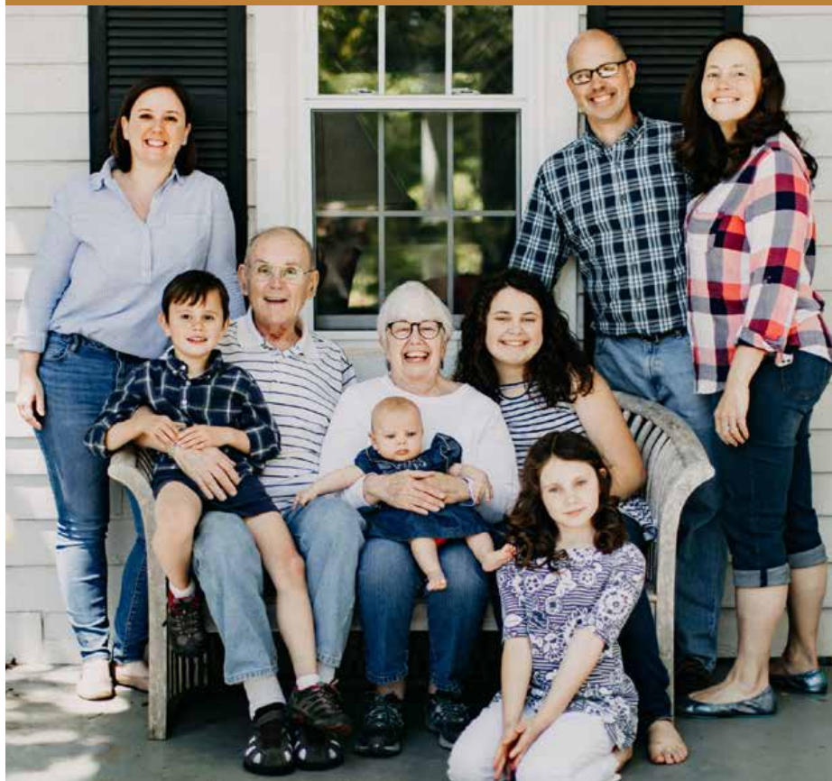
WITH MY PARENTS AND OLDER BROTHER'S FAMILY

My mom loves to sew and quilt. She has taught me to quilt over the years. I'm definitely not as talented, but I am pretty good! My mom and I love to go see musicals, plays, and ballets, either in Chicago, Madison, or even New York!