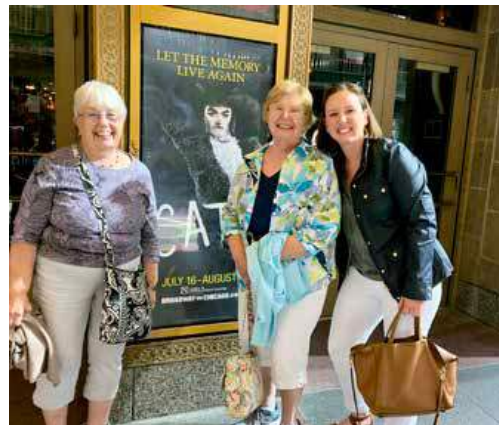
SEEING A MUSICAL IN CHICAGO WITH MY MOM AND AUNT