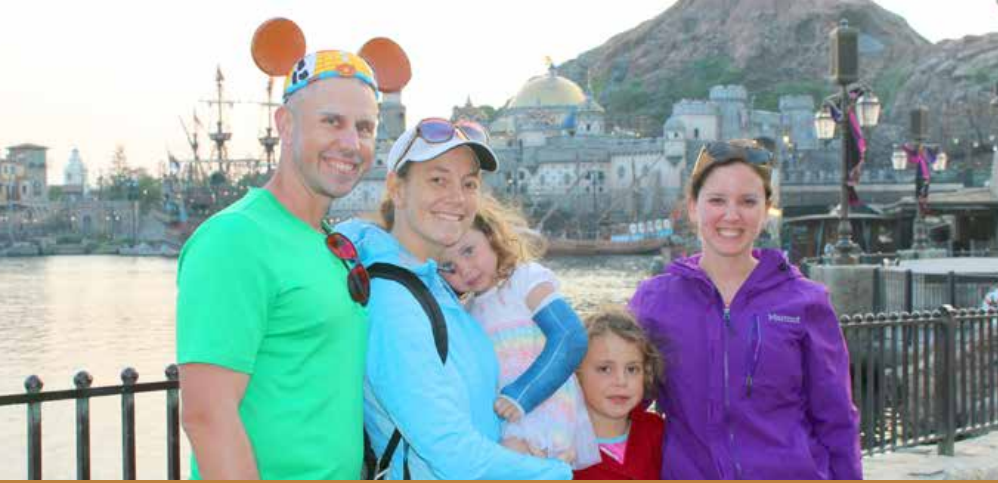
VISITING TOKYO DISNEY WITH MY BROTHER AND HIS FAMILY