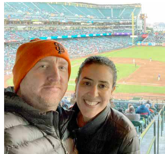
CATCHING A BASEBALL GAME