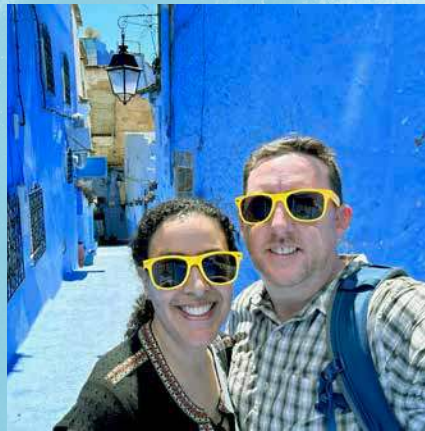
HAVING FUN IN MOROCCO!