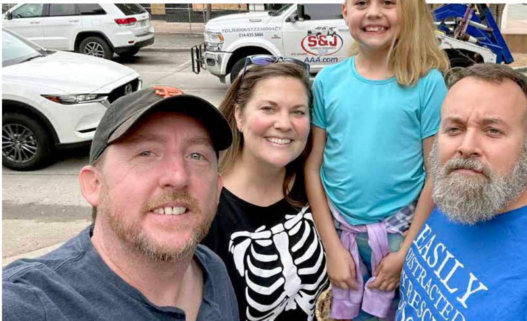
VISITING CLOSE FRIENDS IN DALLAS FOR HALLOWEEN