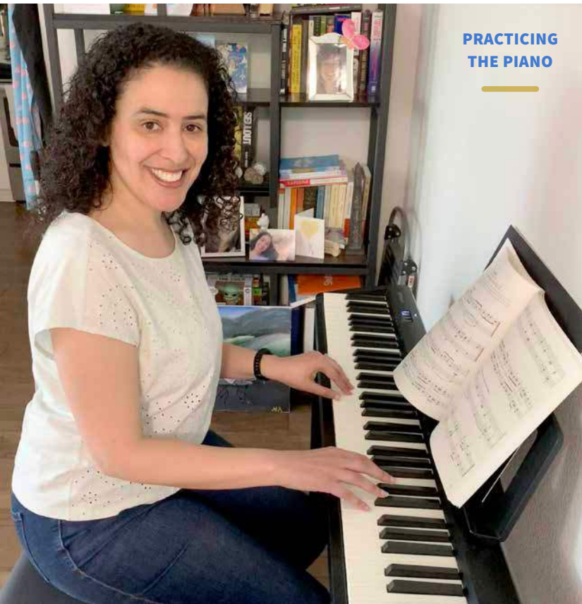
PRACTICING THE PIANO