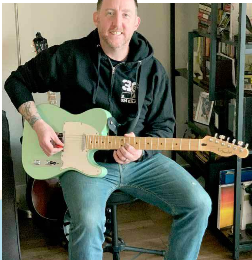
PRACTICING THE GUITAR