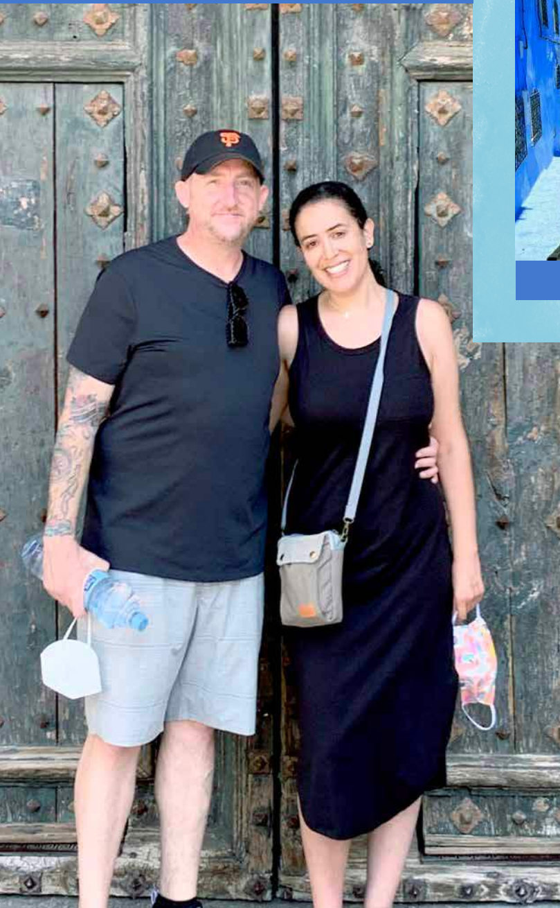
WE LOVED VISITING GIRONA, SPAIN

Gordon not only found Robin so interesting, but even more beautiful. We share the same values of kindness to others, appreciating different cultures, a love of travel, music, food, and pets. We even have our own secret handshake!