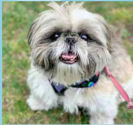
CHECKING OUT THE LOCAL FOOD TRUCK SCENE WITH OUR DOG RILEY