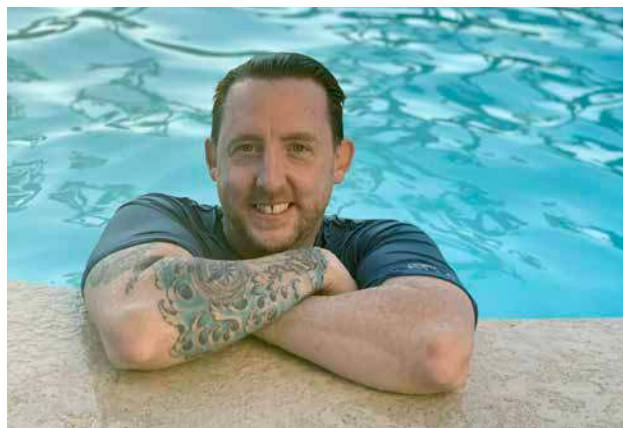
PLAYING IN THE POOL