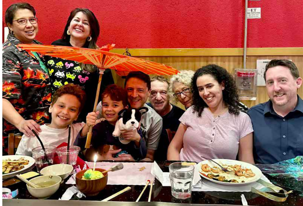
THERE ARE ALWAYS LAUGHS WITH FAMILY