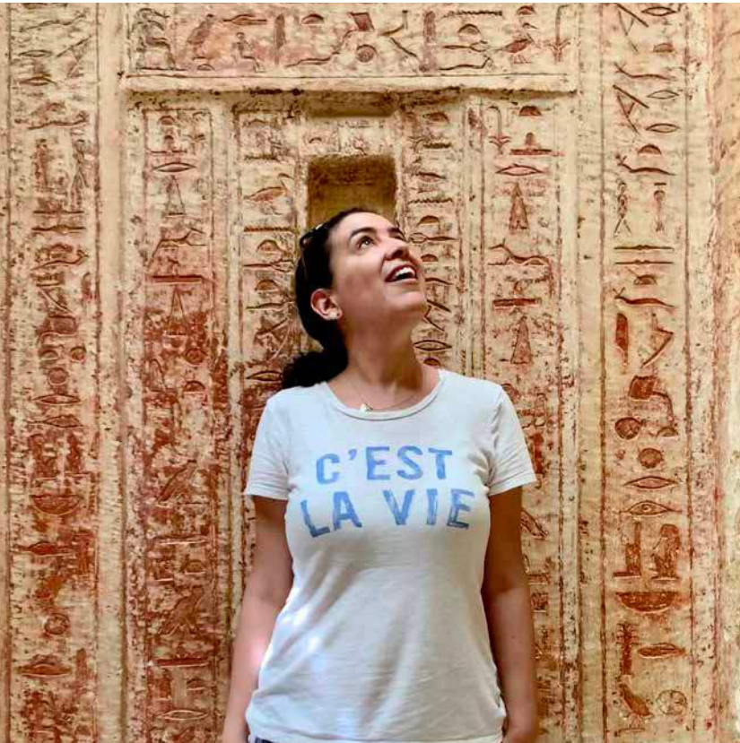
IN AWE OF A TEMPLE IN EGYPT