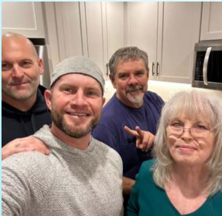
Dinner with Family