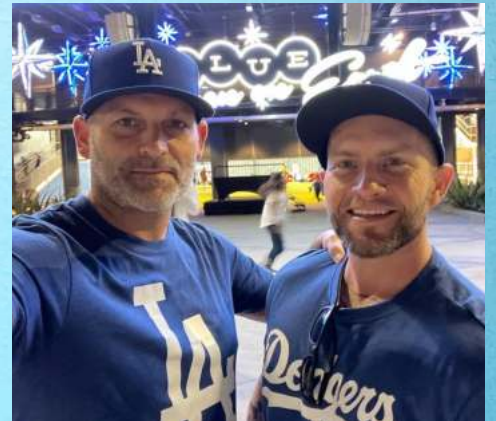
We Love the Dodgers