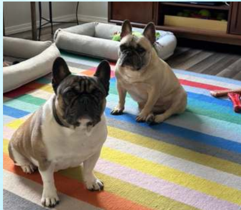
Tank & Bear