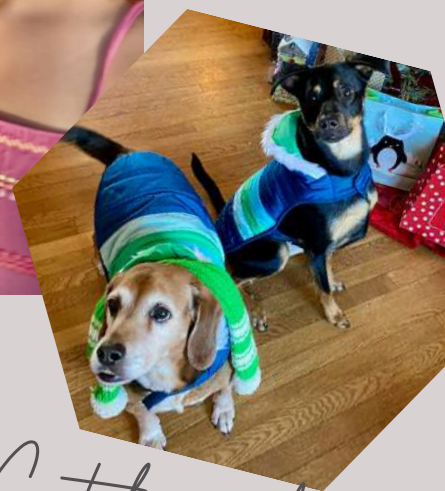
Gatsby + Luna